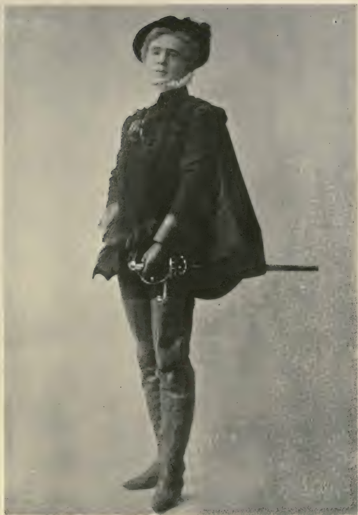
Photograph by Sarony, New York